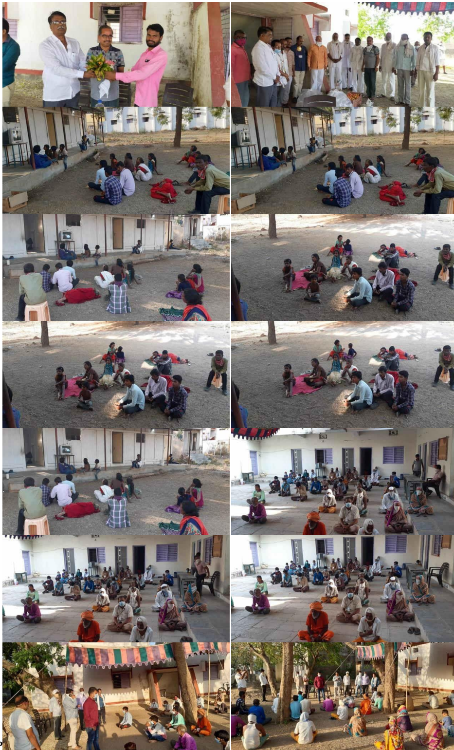
Photographs of Boys' Hostel (Migrate People Accomodation)